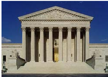
The US Supreme Court

The members of the Supreme Court, of course, realized what was happening to them and the system of law. The court was being asked to perform in a creditor, debtor bankrupt proceeding to the benefit of the banker creditors. The members of the Supreme Court said, "NO. We will not give you a bankrupt proceeding decision that you can then enforce