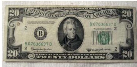
This is not money - it is a privately owned "FEDERAL RESERVE NOTE"

The Corporate U.S.. Government provides, or at best pretends to provide for this reservation of rights under the Uniform Commercial Code (UCC) 1-207 and 1-103. You need more information in this area. It is not in the best interest of the United States Corporate "PUBLIC" schools to teach you about their bankruptcy proceedings and how they have set the snare to Compel you into paying their debt. The Corporate "PUBLIC" schools are strictly designed for their Corporate citizen/subjects. That is the Corporate U.S.. Public School citizens.