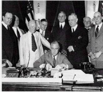
FDR confiscated the people's gold in 1933

you try to look up the 1930 minutes, you will not find them because they don't publish this particular volume. If you try to find the 1930 volume which contains the minutes of what happened, you will probably not find it. This volume has been pulled out of circulation or is hidden in the library and is very hard to find. This volume contains the evidence of the bankruptcy.